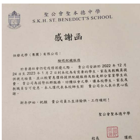
Thank you letter from S.K.H St Benedict's School