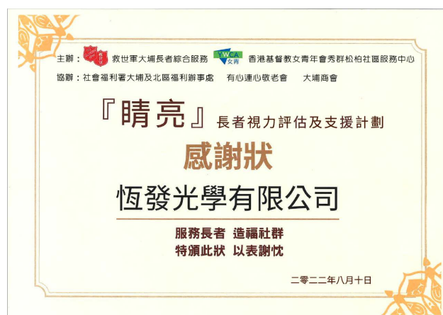
Certificate of appreciation from the Tai Po integrated services for senior citizen of the Salvation Army and Ellen Li District Elderly Community Centre of Hong Kong Young Women's Christian Association