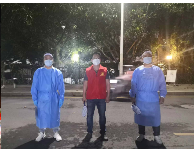
Volunteering in the local COVID-19 testing and vaccination programme