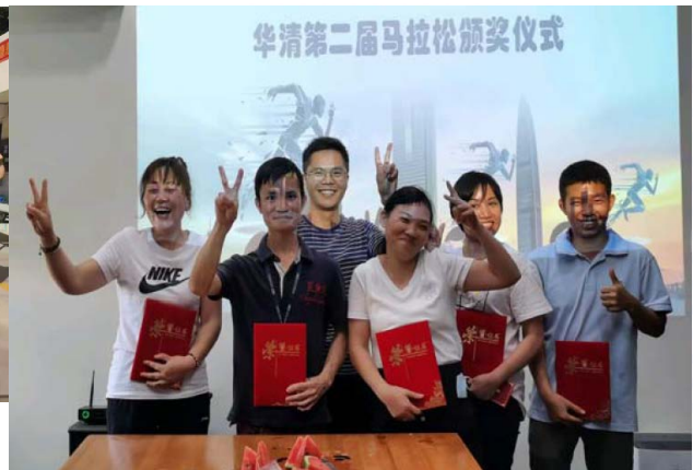
Marathon awards ceremony